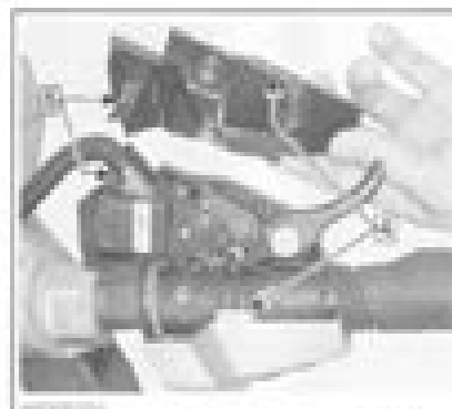
Image 1: Press on the housing cover to lock it. Image 2: Press on the housing cover to lock it.