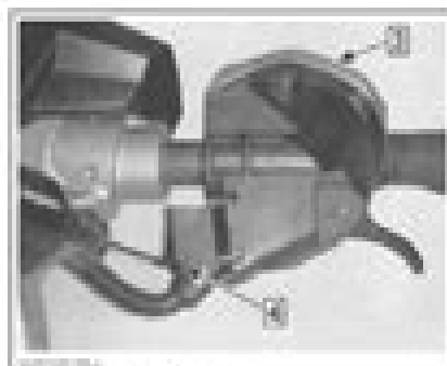
Image 2: Press on the front tab of the housing cover. Image 3: Connect the tab.

5. Remove the housing cover from the handlebar.