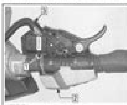
Image 1: Position wiring to properly route. Image 2: Press on the cover to lock it. Image 3: Press on the cover to lock it.