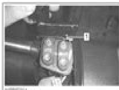
Image 1: Press on the cover to lock it. Image 2: Press on the cover to lock it.