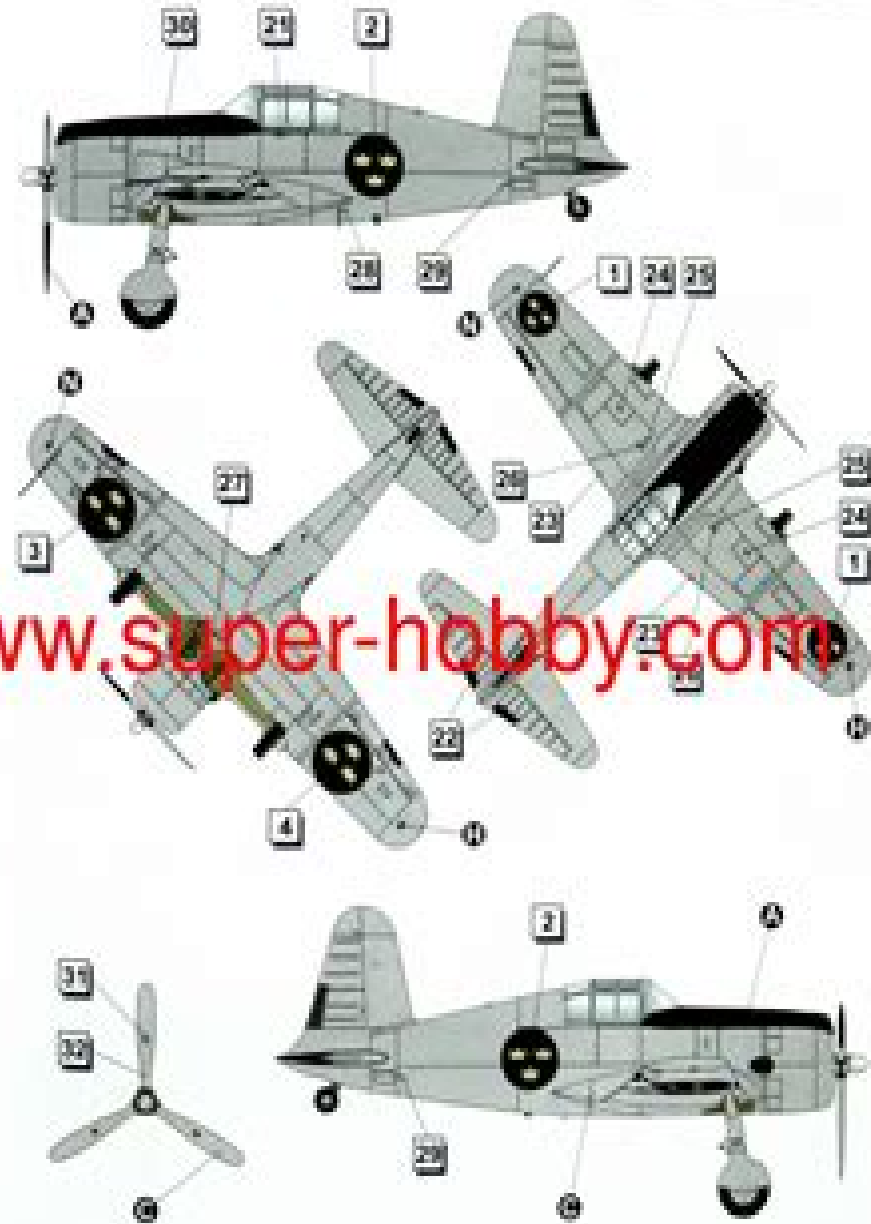
Vultee J-10 (c/n 501), California, September 1940