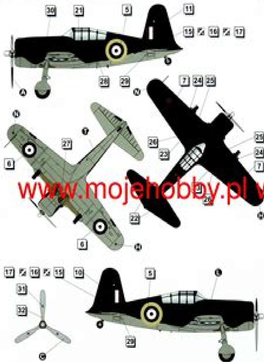
Vultee Vanguard Mk.I (c/n 502), California, 1940