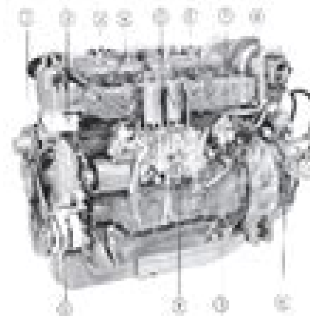
Fig. 4 Engine TAMD60, TAMD60C

The fuel system is well protected from interruptions during running by means of electrically operated fuel line filter. On the TAMD60 engines the fuel injection pump is large mounted under the other engine from the pump fitted on a bracket.