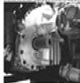
3 Fit a new oil filter and secure the oil filter housing. Fit the filter housing onto the gearbox.

Note: The filter housing is a fit component inside the large housing. Push in the filter housing until it reaches the large housing. Tighten the bolts to 4 x 1 Nm, and then torque tighten the bolts to 40 x 1 Nm.