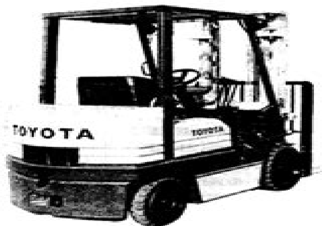
Vehicle Rear View