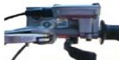
Throttle cable/ Front & rear brake lever pivot