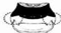
FACE SENSOR (left and right side)