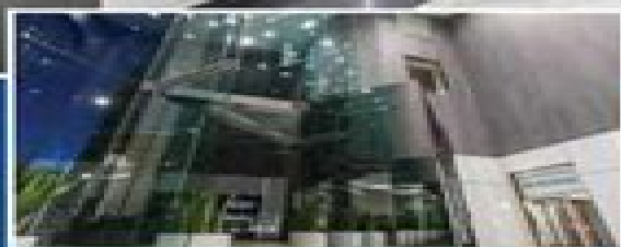
801 Tower on South Figueroa Los Angeles, California