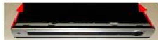
Figure 3 (above) Front View