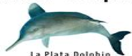
La Plata Dolphin