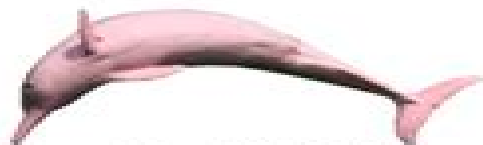
Amazon River Pink Dolphin