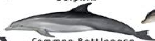
Common Bottlenose Dolphin