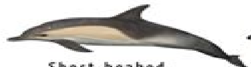
Short-beaked Common Dolphin