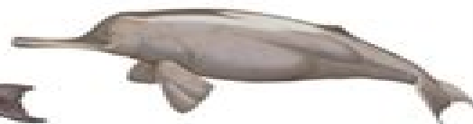
Ganges River Dolphin