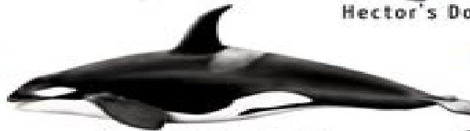
Orca (Killer Whale)