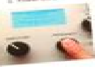
Press and Hold 3 Seconds