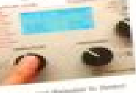
Press and Release to Select Cycle or Hold