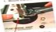
Secure Mounting Platform with Support Plate Assembly