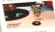
Plug into SHC Input