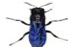
Organ Pipe Mud Dauber