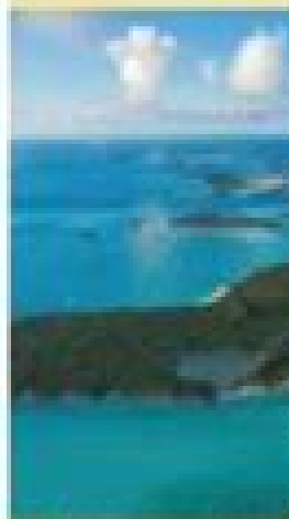
The Explorer's all-in-one chartbook