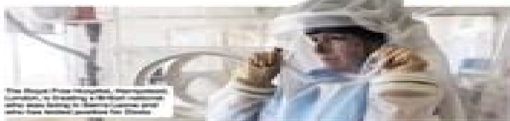
The World Health Organisation (WHO) is creating a global network of experts to help countries deal with Ebola patients and prevent further spread.