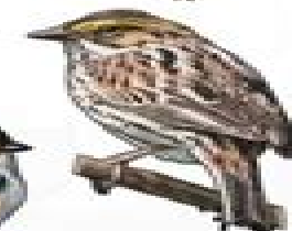
SAVANNAH SPARROW PASSERCULUS SANDWICHENSIS