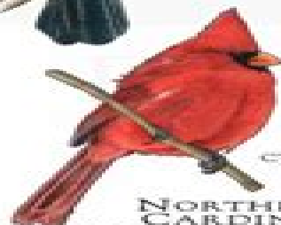
NORTHERN CARDINAL CARDINALIS CARDINALIS