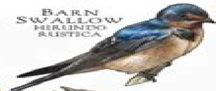
BARN SWALLOW HIRUNDO RUSTICA