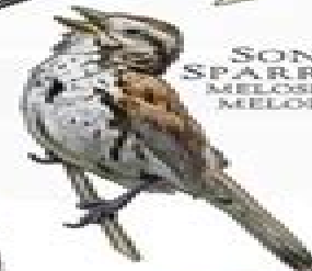
SONG SPARROW MELOSPIZA MELODIA