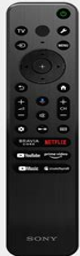
Voice remote control