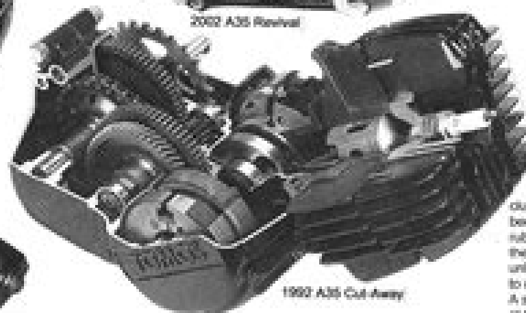
1992 A35 Cut-Away

With the rear wheel stopped, all gears and clutch drum are also stopped. As the centrifugal 1st speed 3-shoe clutch, which is solid with the turning crankshaft, is held inward by its springs, in "neutral". As you give it gas, the rise in rpm throws the shoes outward against the clutch drum, which is solid with the rear wheel via the 1st gear set. This causes the bike to move forward and increase in speed. Above 10mph the 1st spd clutch stays solid with the double sided drum, meanwhile the centrifugal 2nd speed clutch, which is solid with the rear wheel via the 2nd speed gear set, is held in by its springs until the bike speed hits 15mph. As the 2nd speed