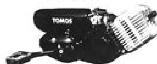
2008 A55 Streetmate R