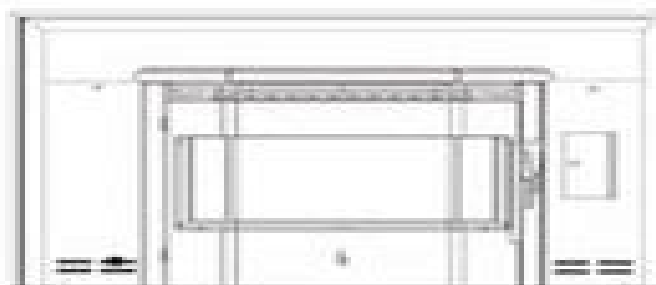
Insert Model Profile® 30 INS

These appliances must be properly installed and operated in order to prevent the possibility of a house fire. Please read this entire owner's manual before installing and using your pellet stove. Failure to follow these instructions could result in property damage, bodily injury or even death. Contact your local building or fire officials to obtain a permit and information on any installation restrictions and inspection requirements in your area.