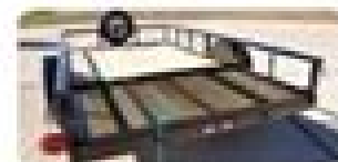
GATE OPTION Optional 48" Straight Ramp Gate Option folds flat on the trailer floor for storage

GVWR: 2,990 lbs BED LENGTHS: 8'-14' BED WIDTH: 60", 77" or 83"