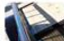
2-3/8" PIPE TOP RAIL OPTION