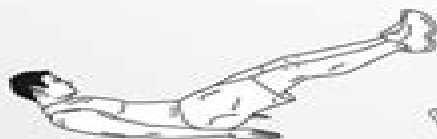
10-count raised leg hold