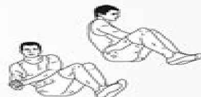
10 sitting twists