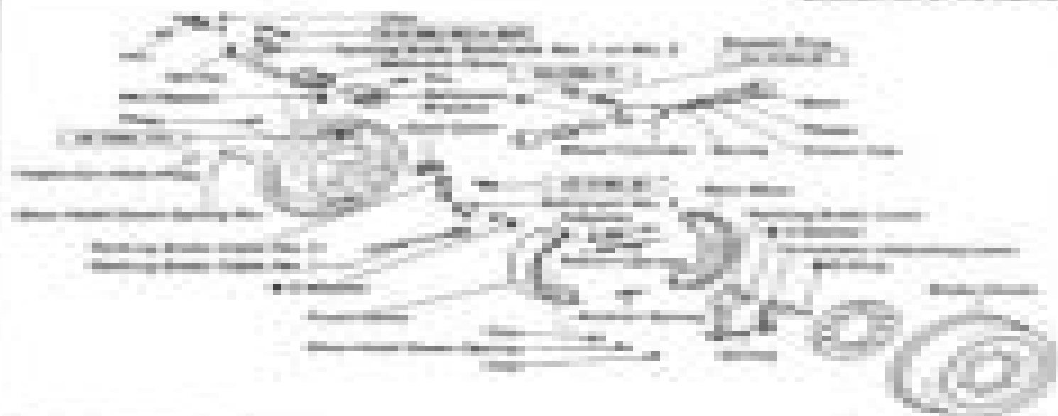
Diagram 1: Overview Cucumbercane Butte