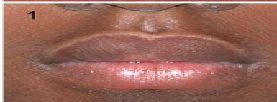
Lip-Philtrum Guide 2