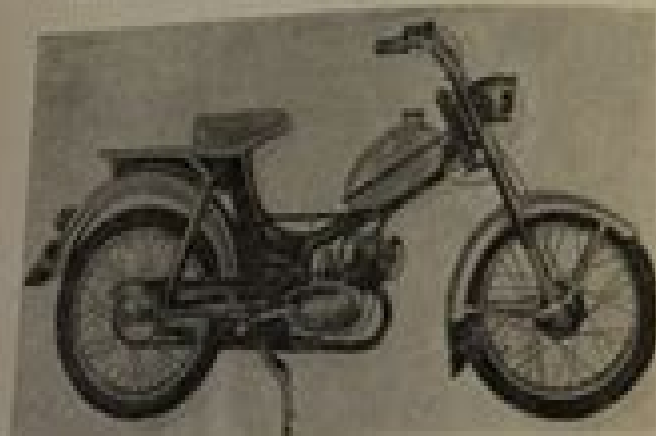
Fig. 1. Moped Bz-4

Since repairs are made essentially by fitting replacement parts, this manual covers the procedures for dismantling and reassembling individual units of the machine and gives fault finding instructions.