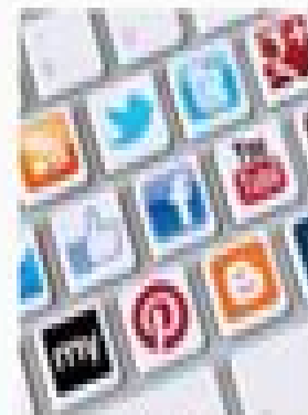
Social Media Not So