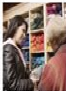
How to Turn Non-