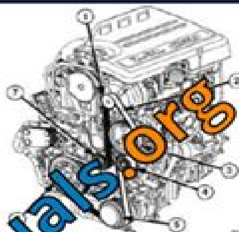
Fig. 24: Accessory Drive Belt Routing - 1.8L Diesel