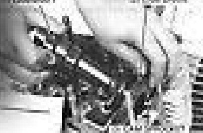
13 CAM CHAIN