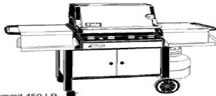
Summit 450 LP