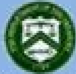
Department of the Treasury