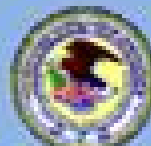
Department of Justice