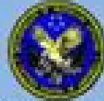
Department of Veterans Affairs