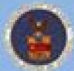
Department of Labor