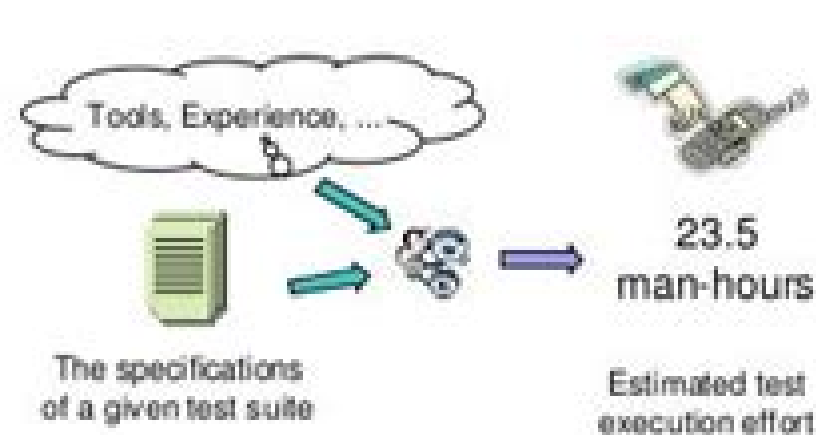
Manual Test Execution Effort Estimation