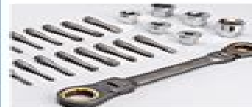
Flexible head ratchet