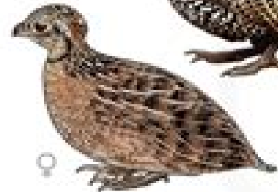
MONTENZUMA'S QUAIL Cyrtonyx montezumae