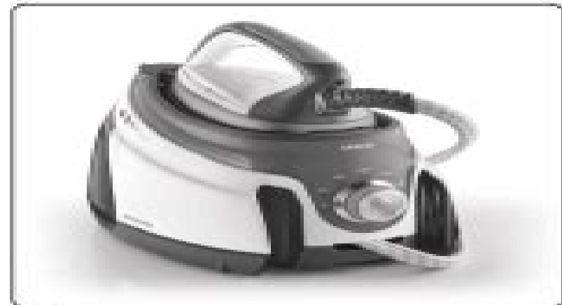
POLTI LA VAPORELLA XTXX - XT9XX - XH5XX

IT - Prima dell'utilizzo leggere attentamente le avvertenze di sicurezza | EN - Read the safety warnings carefully before use | FR - Lire attentivement les avertissements de sécurité avant utilisation | ES - Lea atentamente las advertencias de seguridad antes de usar | DE - Bitte lesen Sie vor der Anwendung die Sicherheitshinweise sorgfältig durch | PT - Leia atentamente as advertências de segurança antes de usar | NL - Lees de veiligheidsaanschuivingen zorgvuldig door voordat u ze gaat gebruiken | PL - Przed użyciem należy dokładnie zapoznać się z ostrzeżeniami dotyczącymi bezpieczeństwa | SE - Läs säkerhetsföreskrifterna noga före användningen.