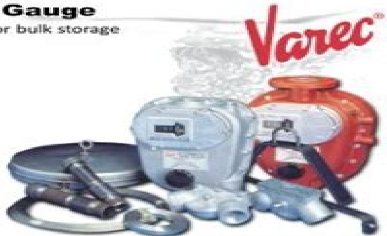
2500 ATG (foreground) 2520 ATG (background)