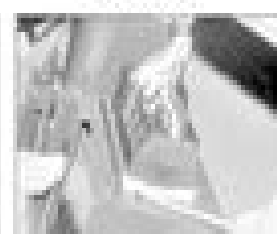
11.8 Undo the side and end panel surround from the face