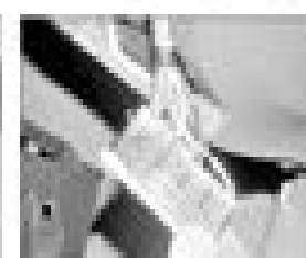
11.11 Undo the side and end panel surround from the face