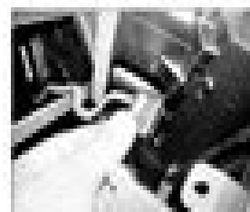
11.2 ... undo the heater retaining screws using a screwdriver from the panel ...

2 Remove the light switch located on the