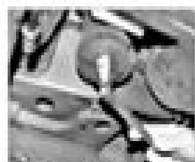
10.3a Unscrew the fuel filter base.