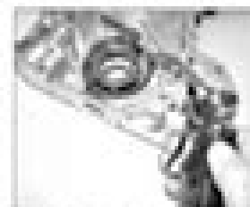
10.5a Thoroughly lubricate the pump internal components with clean engine oil, then with the pump cover.