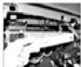
10.2a ...then remove the filter from the housing.