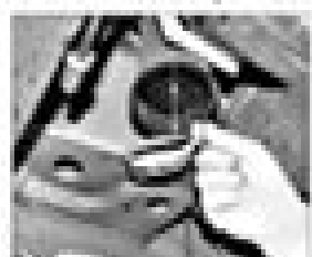
10.5a Remove the housing ring from the filter housing.