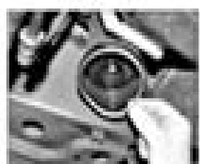
10.7a Fit a new housing ring to the filter housing.