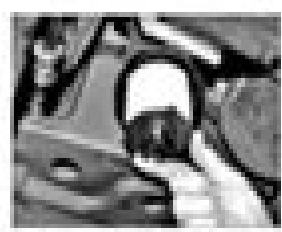
10.6b Locate the new filter in the housing and push it up until it engages with the retaining cap.