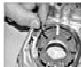
10.1a Locate the screw at pump cover into the side of the valve cover.

the filter with the right-hand nutty, secured by the valve ring, facing the valve into the housing.