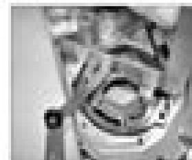
10.3a Measure the end dimension.