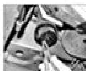
10.6a Using a screw, pull the old filter from the housing.