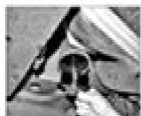
10.4a ...and remove it from the housing.