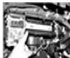
10.1a Release the retaining bracket and open the fuel filter housing cover.

7 Tighten the filter base and tighten it to the