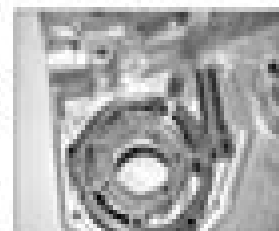
10.4a ...and take dimensions of the pump internal components using a straight edge and feeler gauge.