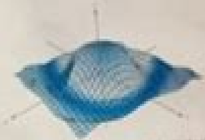
FIGURE 11.2.2 A 3D plot of the function f(x, y) = x^2 + y^2

Thus, \lim_{(x, y) \rightarrow (0, 0)} f(x, y) = 0 . If we plot f(x, y) = x^2 + y^2 for x, y \in [-1, 1] , we get a graph that is indeed well behaved near the origin (Figure 11.2.2). \square