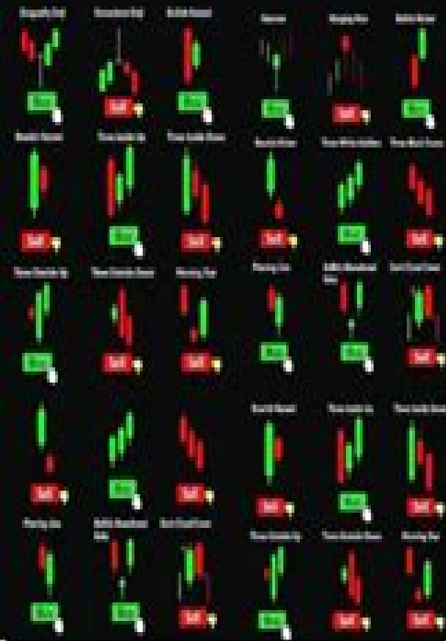
CHART PATTERNS CHEAT SHEET