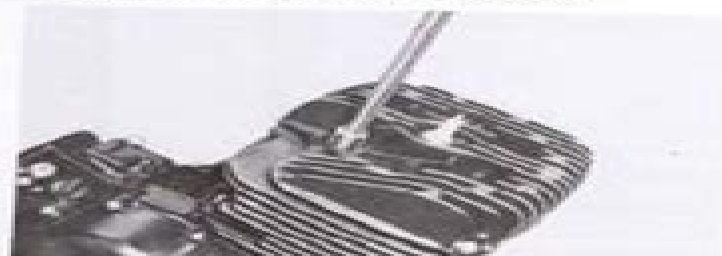
Fig. 9. Loosen cylinder head nuts sequentially, loosening each nut just a little at a time, and take off the head.