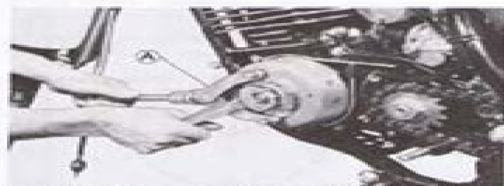
Fig. 5. Hold the rotor with special tool ① (09930-40113), and unscrew the nut securing the rotor.

NOTE: To facilitate engine removal, have the magneto rotor and stator removed, as shown in Figs. 5 through 7: