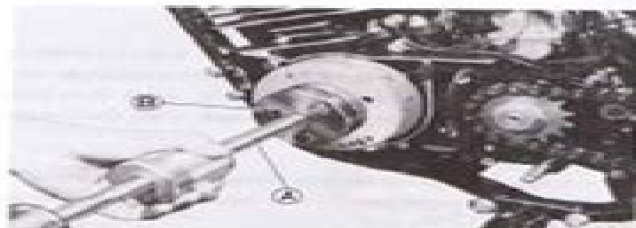
Fig. 6. Draw out the rotor by operating the special tools ① ② (09930-30101) (09930-30150) as shown.