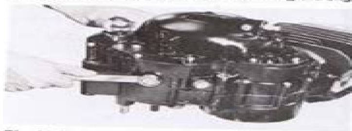
Fig. 8. Remove oil drain plug and let out oil.

The sequence of steps for disassembling the engine taken down from the chassis is as follows: