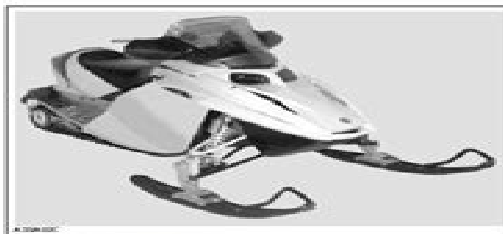
TYPICAL — REV SERIES

This shop manual covers the following Bombardier made 2004 REV Series models: