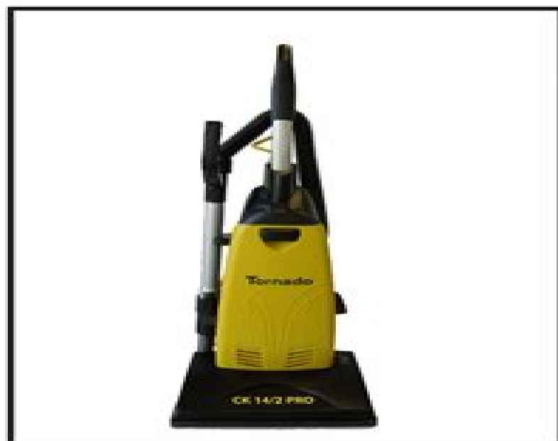
CK 14/1 PRO & CK14/2 PRO MODEL NO: 98147/98152