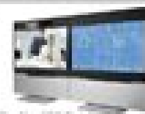
Profile 60" Dual