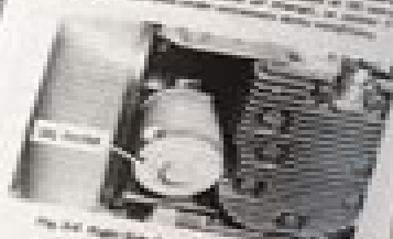
Fig. 2-4: 10-100 or 10-200 oil filter.

The engine is equipped with a 10-100 or 10-200 oil filter. The oil filter should be changed every 1000 miles or 100 hours, whichever comes first.