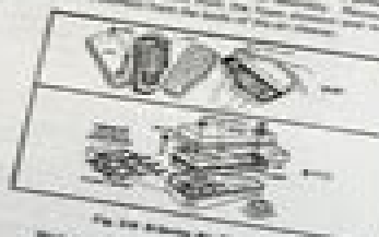
Fig. 2-7: 1/2" nut located on the left side of the engine.

Remove the 1/2" nut located on the left side of the engine. The 1/2" nut is located on the left side of the engine.