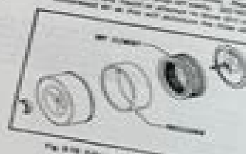
Fig. 2-8: 10-100 or 10-200 oil filter.

The engine is equipped with a 10-100 or 10-200 oil filter. The oil filter should be changed every 1000 miles or 100 hours, whichever comes first.