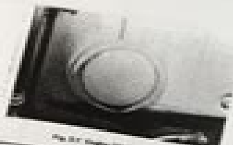
Fig. 2-5: 10-100 or 10-200 oil filter.