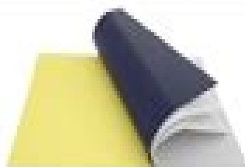
Transfer tattoo paper*1