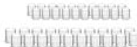
Tattoo ink caps*40