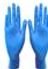
Pair tattoo gloves*1