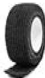
Tattoo grip bandage*1