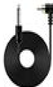
Clip cord *1