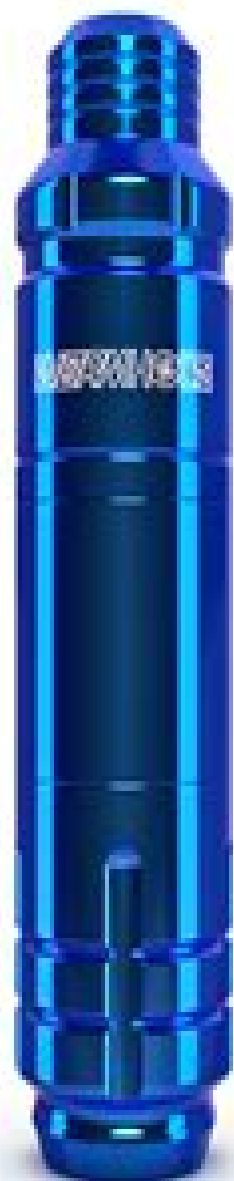
Tattoo pen *1