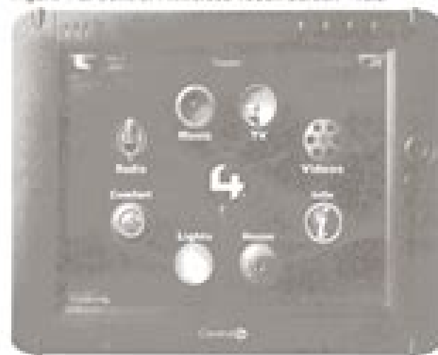
Figure 1-3. Control4 Wireless Touch Screen - 10.5

This Control4 product is a 10.5 inch mobile flat panel.