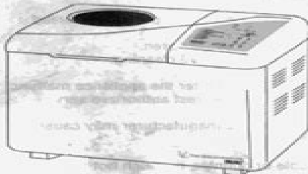
MODEL ABM3500/ ABM8200