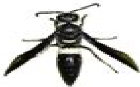
Four-Toothed Mason Wasp