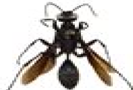
Great Black Wasp