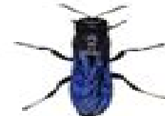
Organ Pipe Mud Dauber