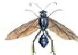
Common Blue Mud Dauber Wasp