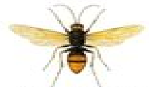
Cicada Killer Wasp