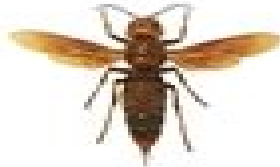
Asian Giant Hornet