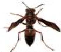
Northern Paper Wasp