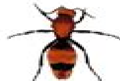
Cow Killer Wasp