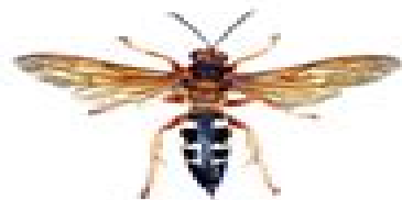
Cicada Killer Wasp