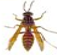
Red Paper Wasp