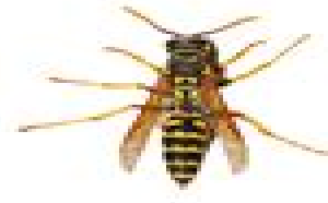
European Paper Wasp