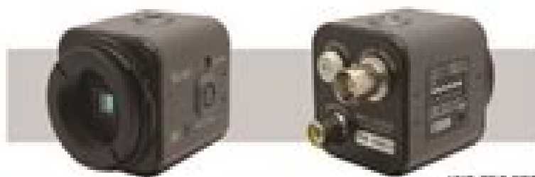
HMD CE & FCC

Coaxial video transmission system makes CCTV installation much easier