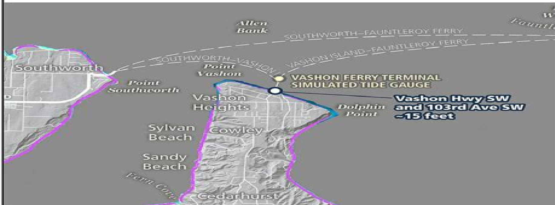
Tsunami Wave Height vs. Time: North End Ferry Terminal