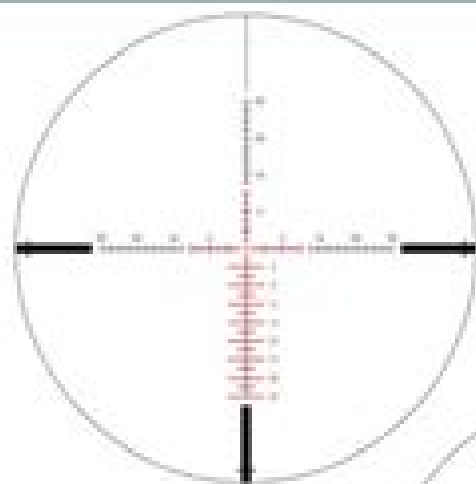
2-10 x 32 EBR-4