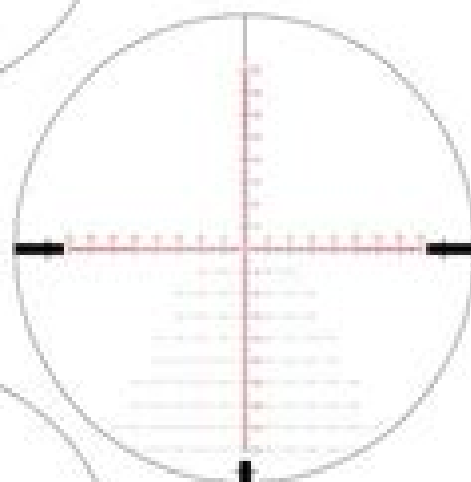
3-15 x 44 EBR-2C