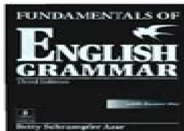
LONGMAN FUNDAMENTALS ENGLISH

In the same page, you'll find these other two: Longman English Grammar and Longman English Grammar Practice (I used them when I was a student like you ☺) the first one contains all the grammar reference and the other one, just brief notes of theory reference and a lot of activities to practice. As they are pretty old, they don't make any reference to new approaches of grammar teaching. But if you want, feel free to download them.